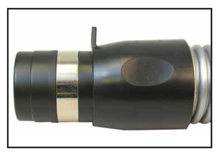
V222 New Style Cuff